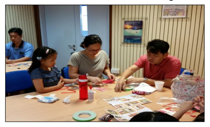
A fun way to promote family bonding - Working together and reminiscing good old times