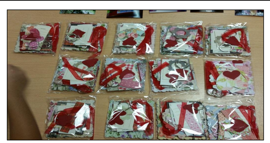
Mini-Album Material Package